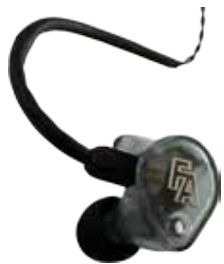
Brand New: FA-3E AMBIENT with alterable isolation against ambient noise 9 dB or 25 dB