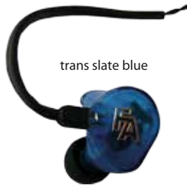
trans slate blue