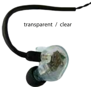
transparent / clear