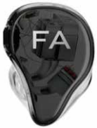
OWN INITIALS CHROME

OWN INITIALS SURCHARGE +50 € net (MAX. TWO LETTERS)