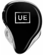
UE NEW LOGO

OWN INITIALS SURCHARGE +50 € net (MAX. TWO LETTERS)